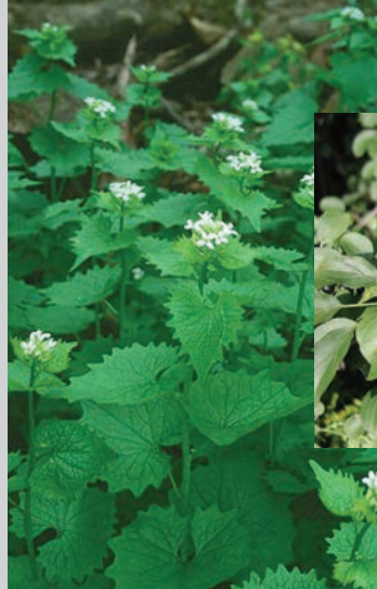
Garlic mustard ( Alliaria petiolata )