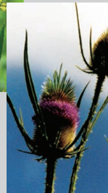
Common teasel ( Dipsacus sylvestris )