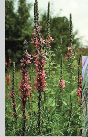
Purple loosestrife ( Lythrum salicaria )