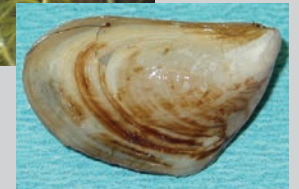
Quagga mussel ( Dreissena bugensis )