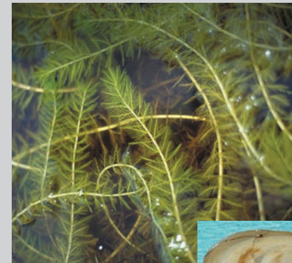
Eurasian water milfoil ( Myriophyllum spicatum )