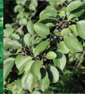
Common buckthorn ( Rhamnus cathartica )