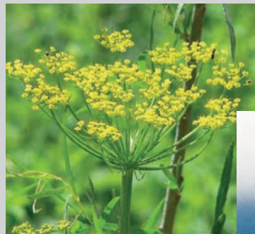
Wild parsnip ( Pastinaca sativa )